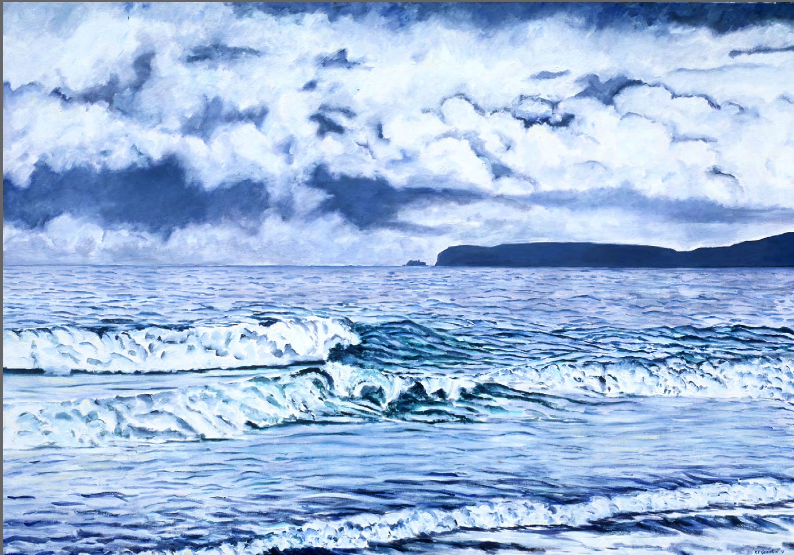
Wave and Chimney Rock 1992 40 x 30 inches Oil on Canvas