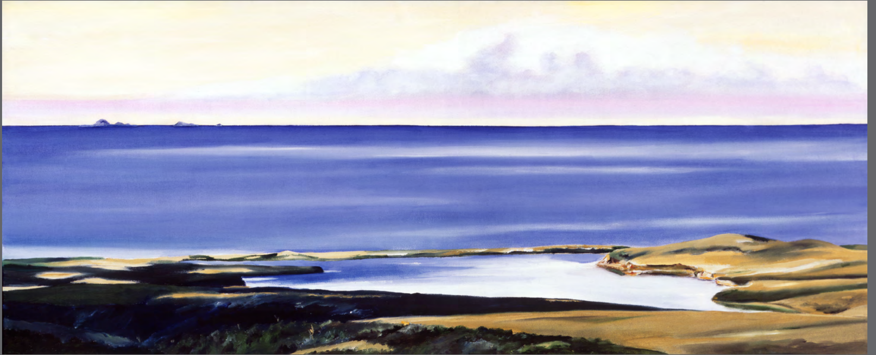
Drakes Estero and the Farallones 2005 48 x 24 inches Oil on Canvas