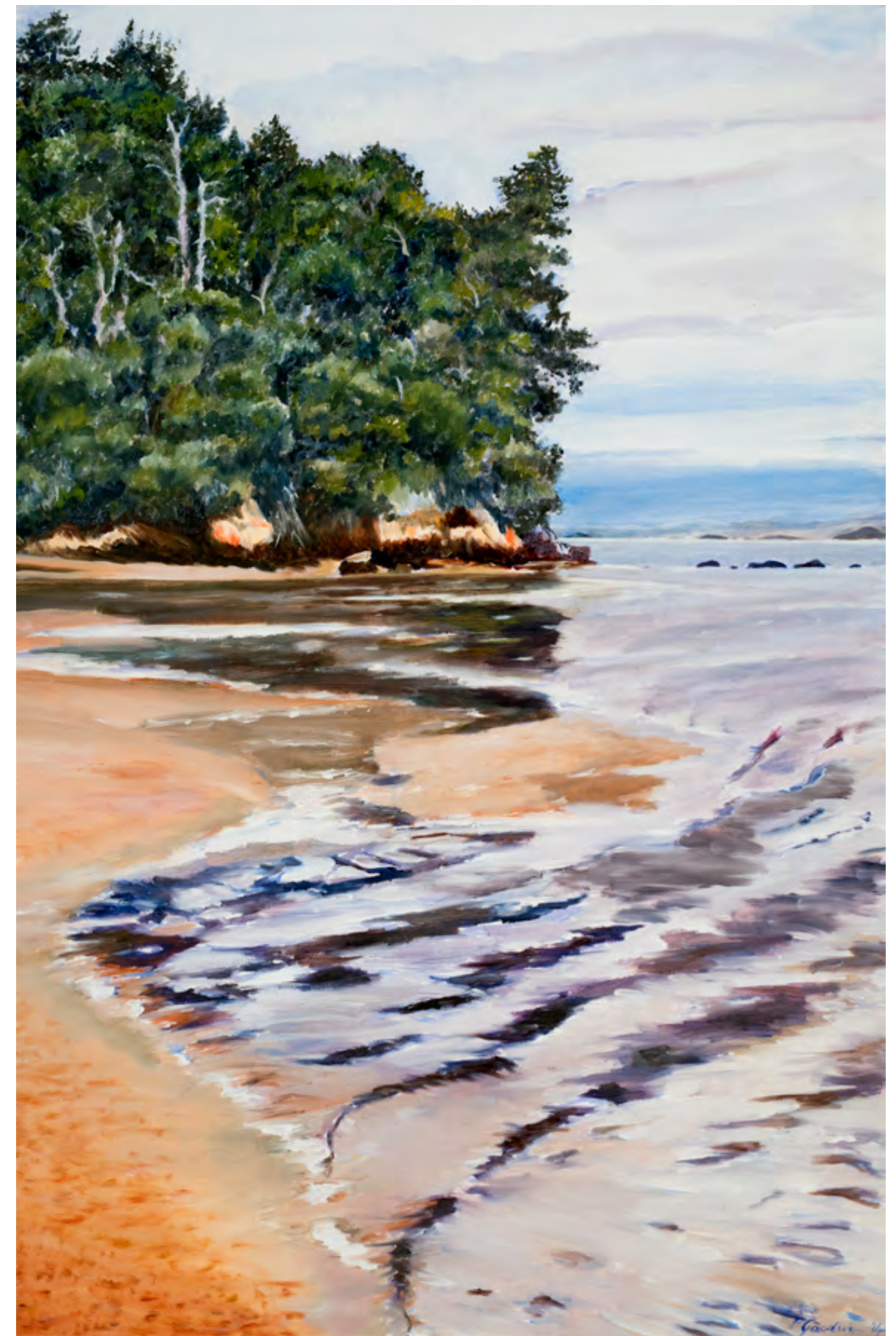
Waves on Tomales Bay Shore, Shell Beach 2014 24 x 36 inches Oil on Canvas