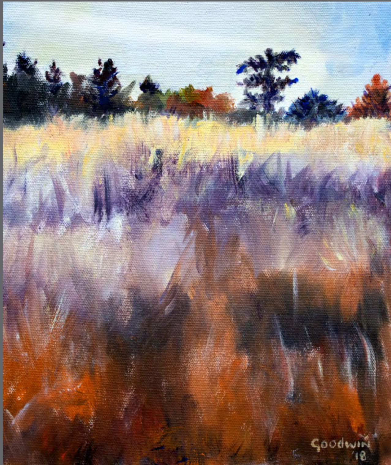
Grasses on Hill near Bear Valley Trail, Point Reyes 2018 12 x12 inches Oil on Canvas