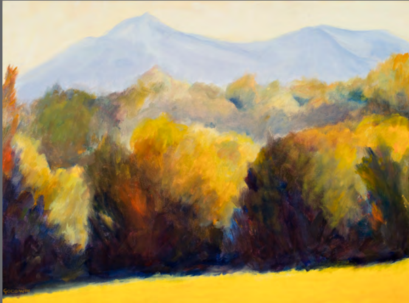
Mount Tamalpais with Trees 2 c. 2017 24 x 18 inches Oil on canvas