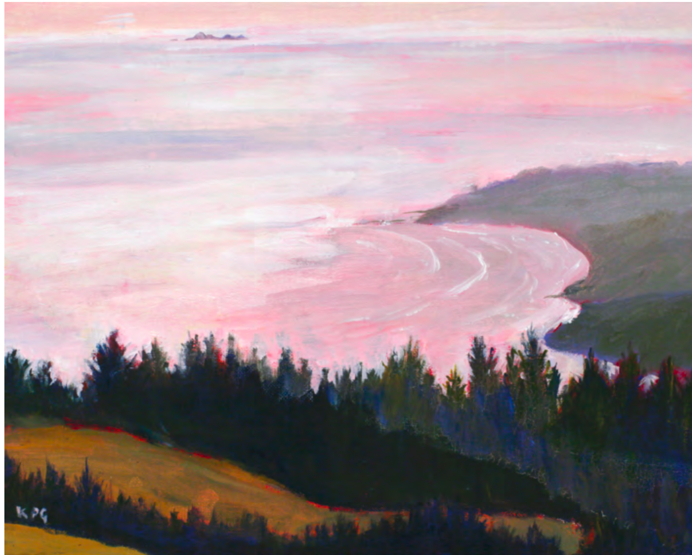
Bolinas and the Farallones from Mount Tamalpais 2012 14 x 11 inches Oil on Canvas Board