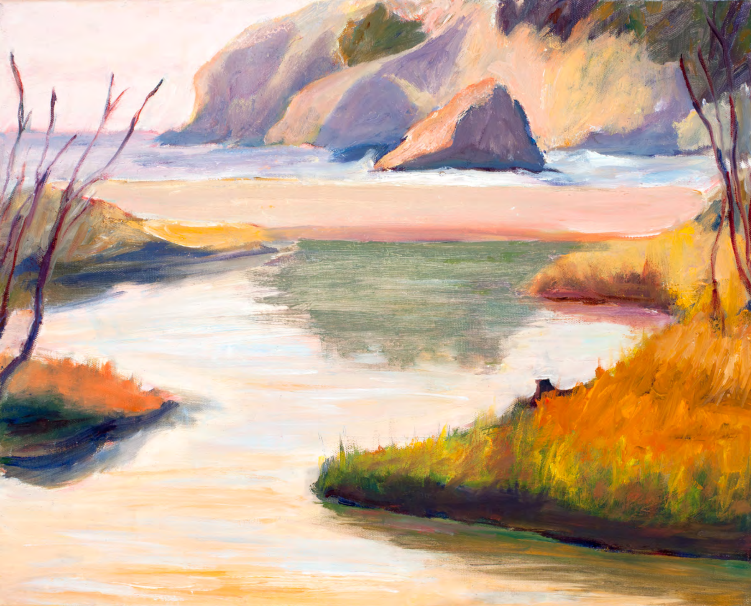
Muir Beach Inlet c. 2012 20 x 16inches Oil on Canvas