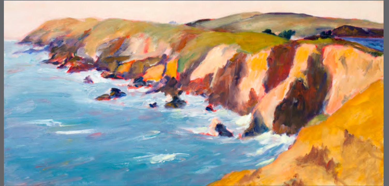
Point Reyes Headlands from Chimney Rock 2017 20 x 10 inches Oil on canvas