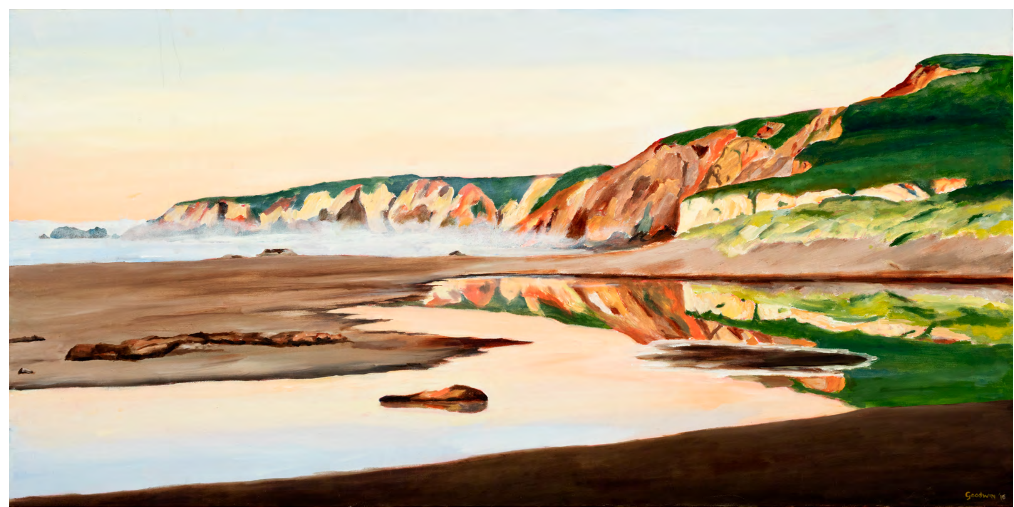
Kehoe Beach Reflections 2016 48 x 24 inches Oil on Canvas