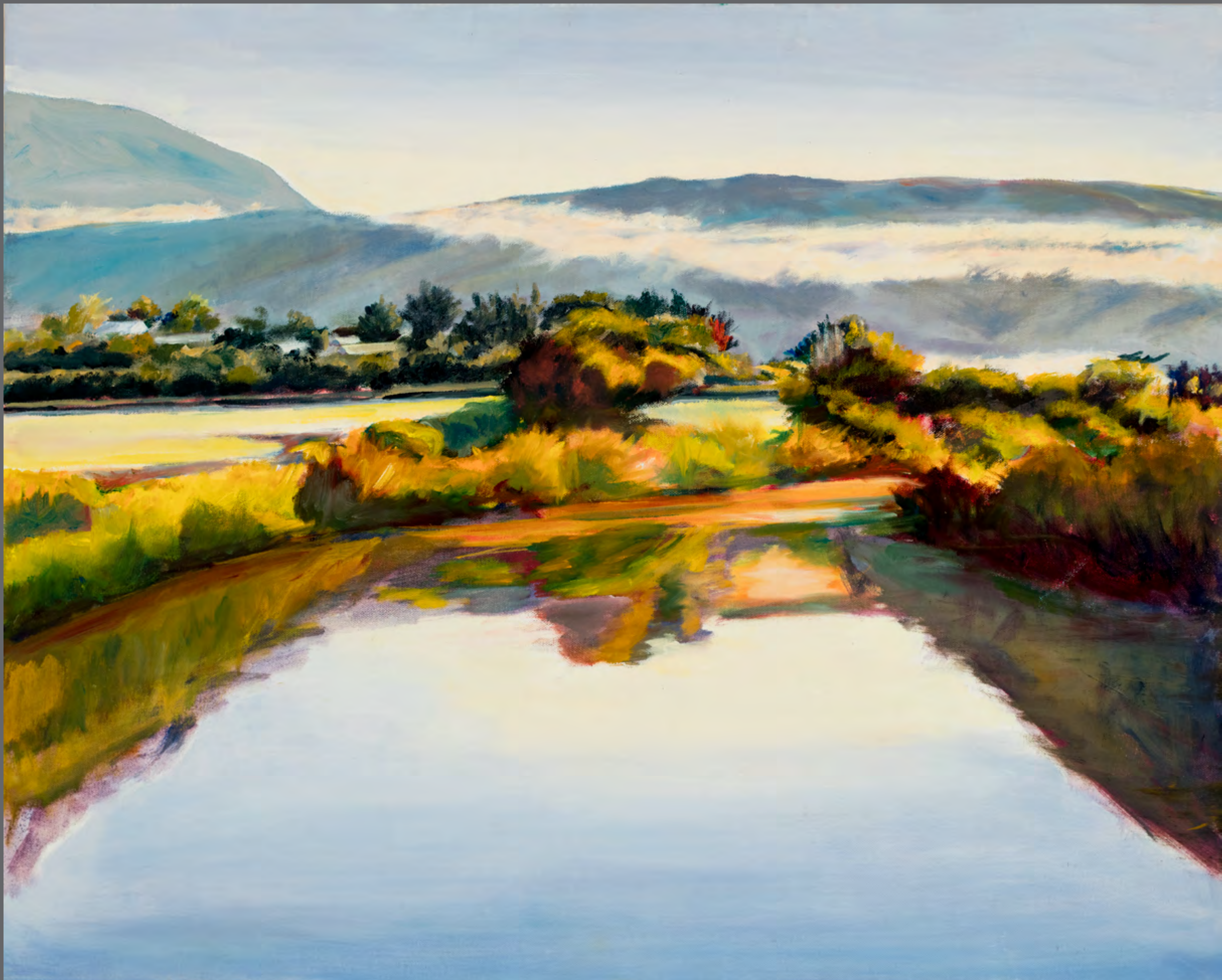
White House Pool 2016 30 x 24 inches Oil on Canvas