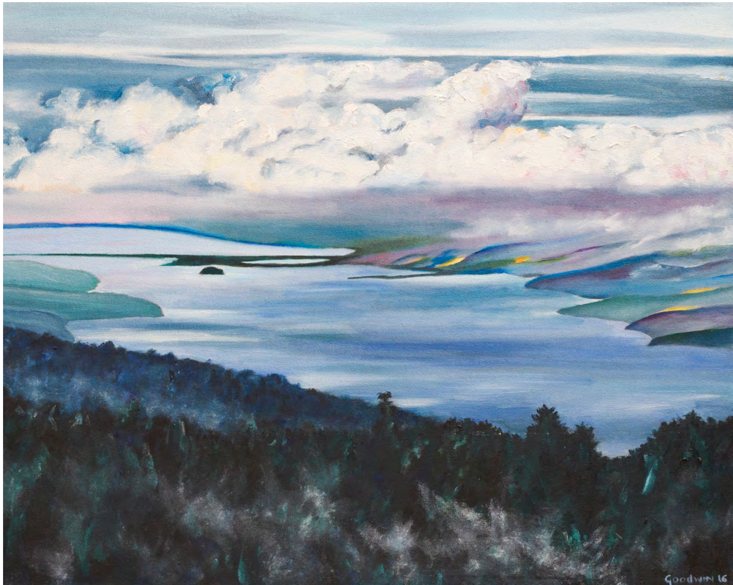
Tomales Bay from Inverness Ridge 2016 32 x24 inches Oil on Canvas