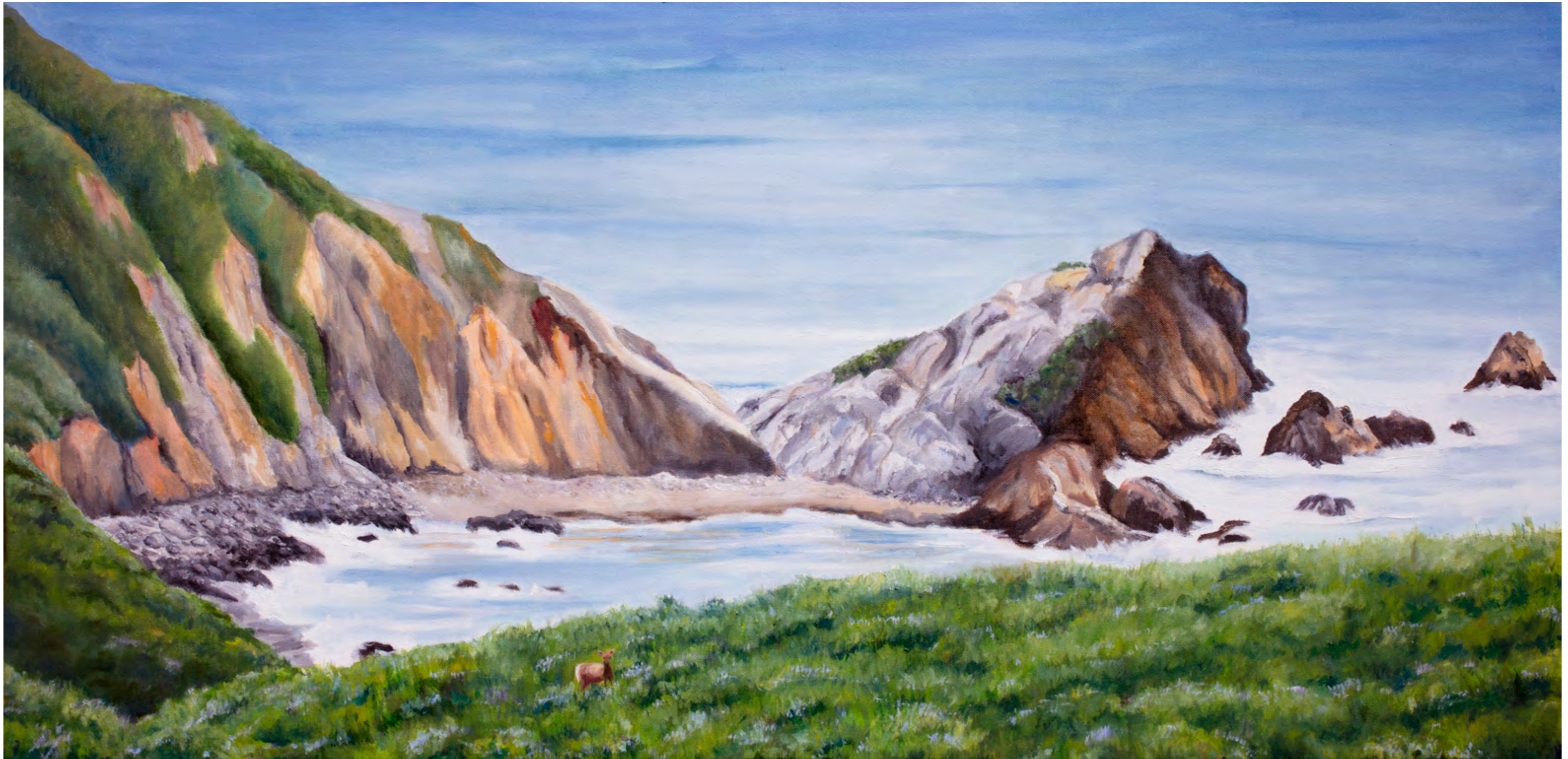
McClures Rock from the Tomales Point Trail c. 2020 48 x 24 inches Oil on Canvas