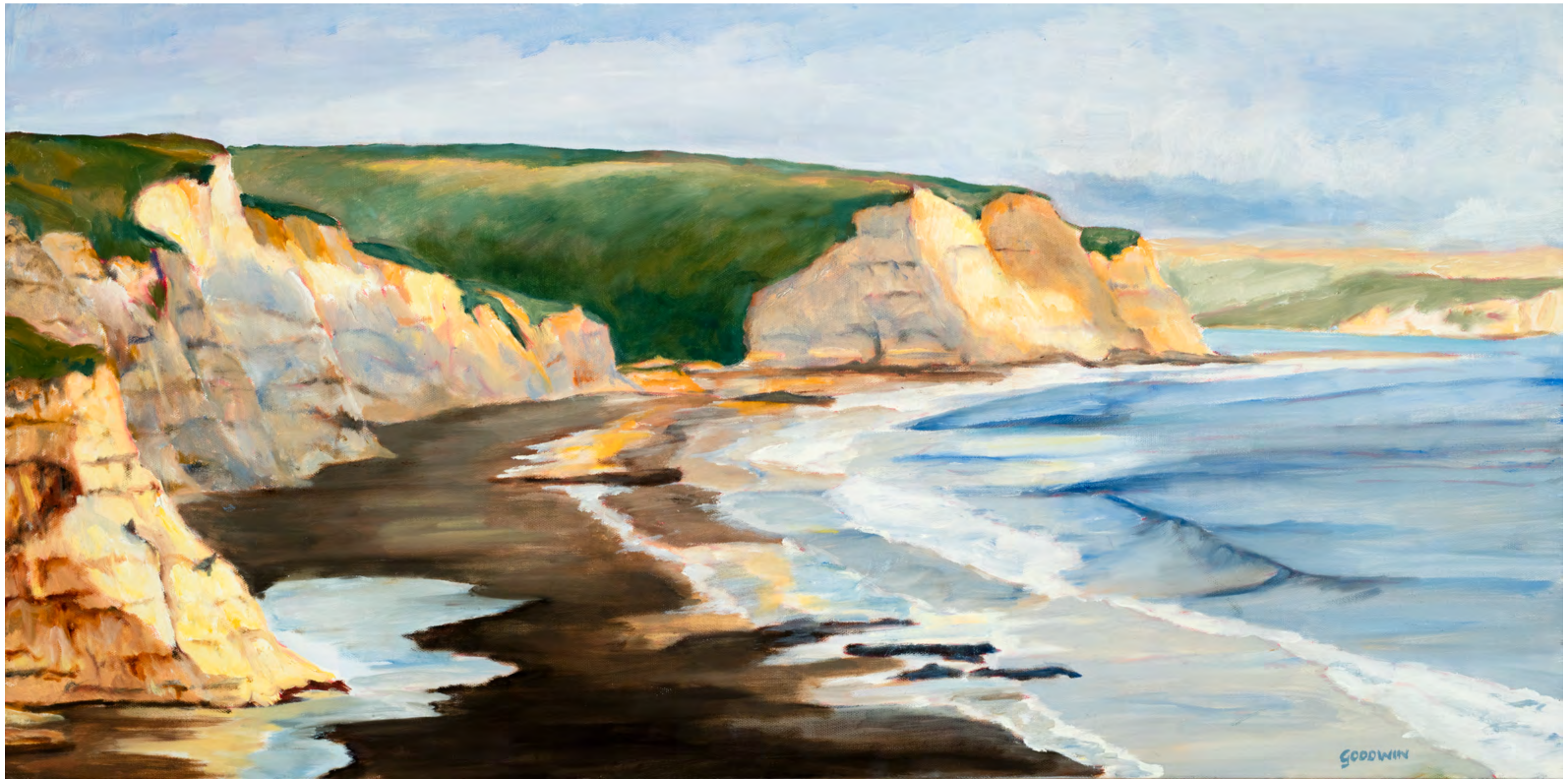
Drakes Beach and Cliffs 2014 36 x 18 inches Oil on Canvas