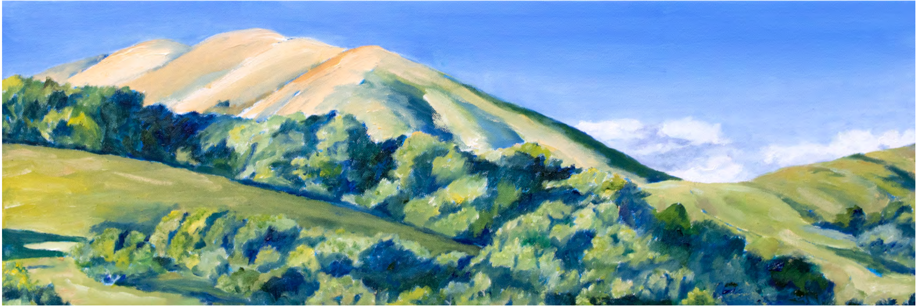
Elephant Mountain from the Bolinas Ridge Trail 2020 30 x 10 inches Oil on Canvas