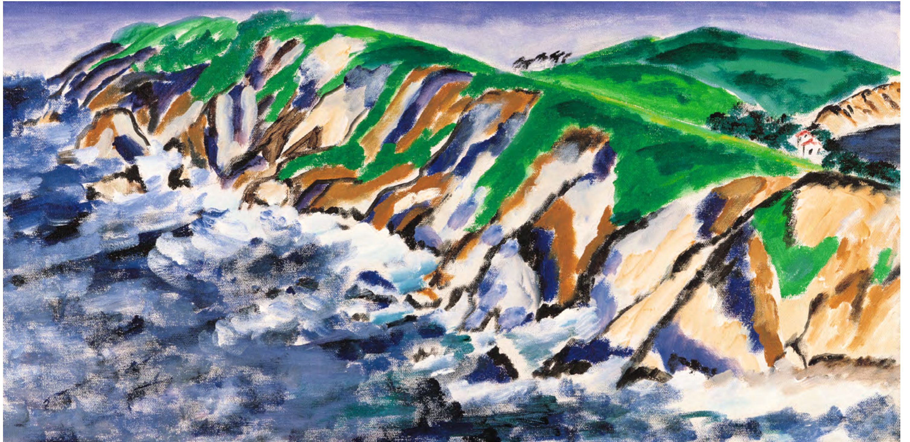
Point Reyes Headlands 1991 24 x 12 inches Acrylic on Canvas