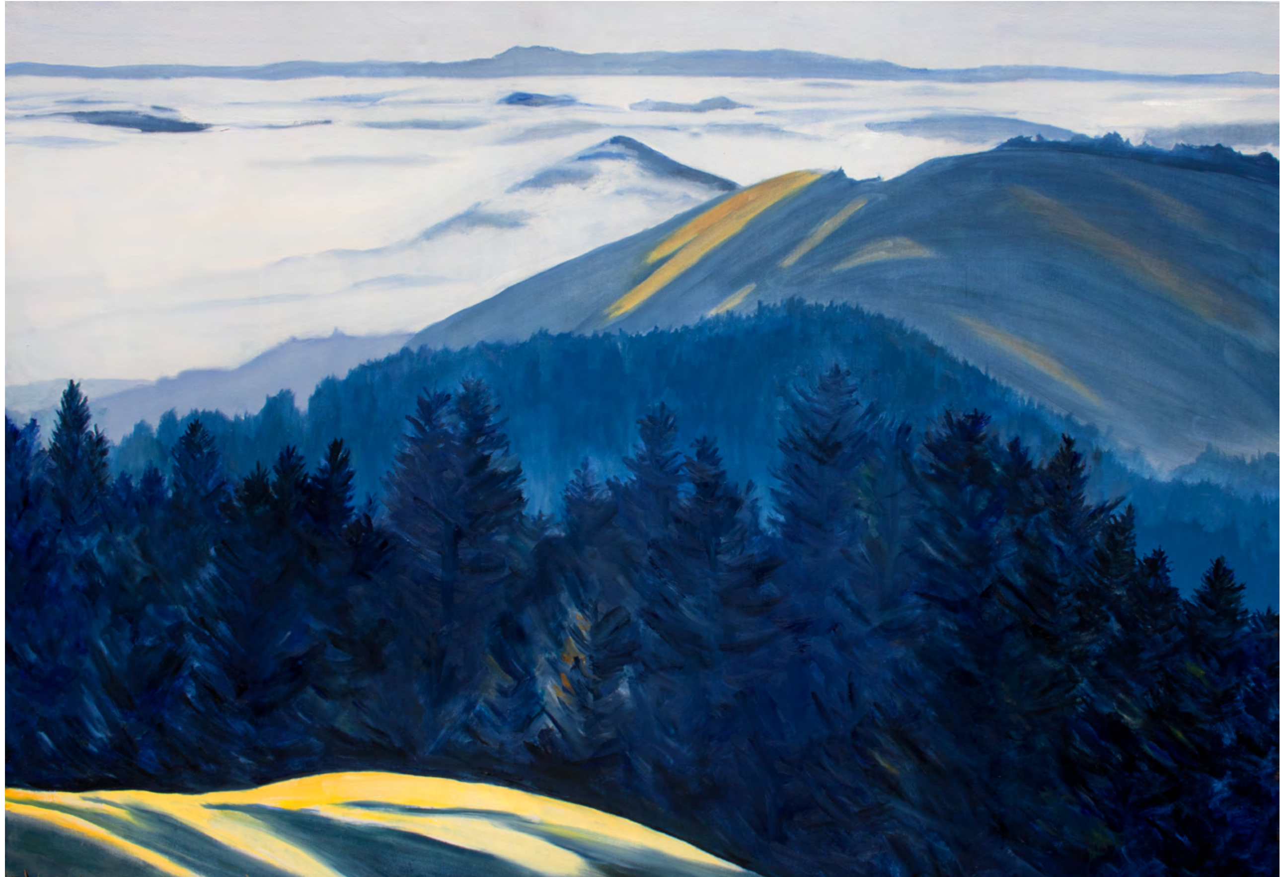
View from Mount Tamalpais 2016 60 x 40 inches Oil on Canvas