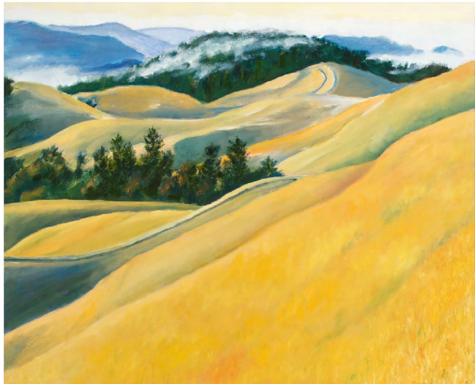
Mount Tamalpais Diptych c. 2010 48 x 24 inches each panel 20 x 16 inches Oil on Canvas