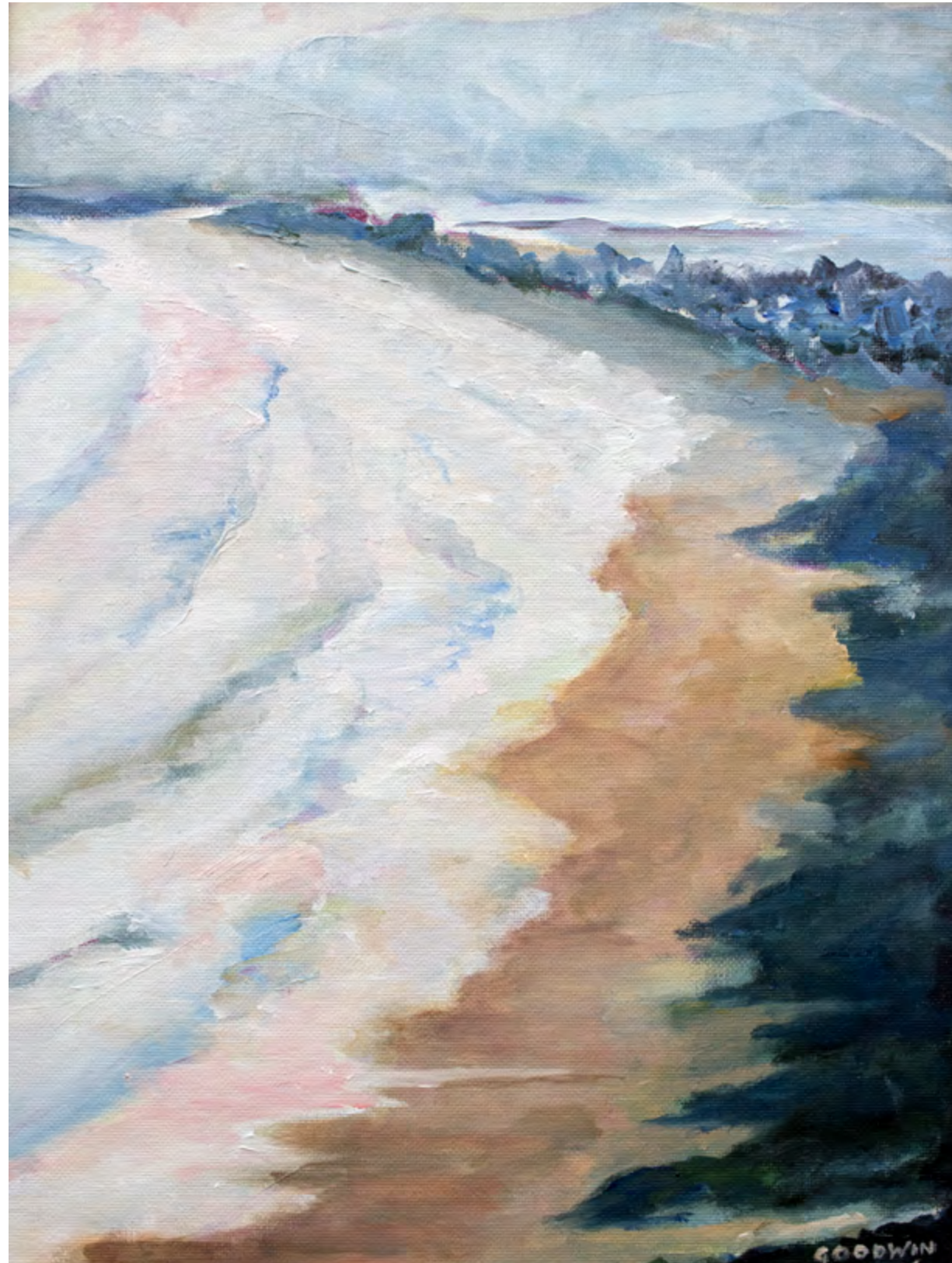
Stinson Beach 2016 12 x 16 inches Oil on Canvas