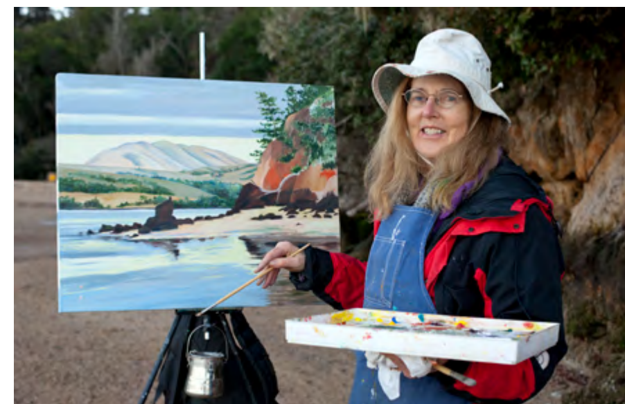
Painting at Shell Beach

I welcome collectors to visit my studio. Please use the contact link on these pages to inquire.