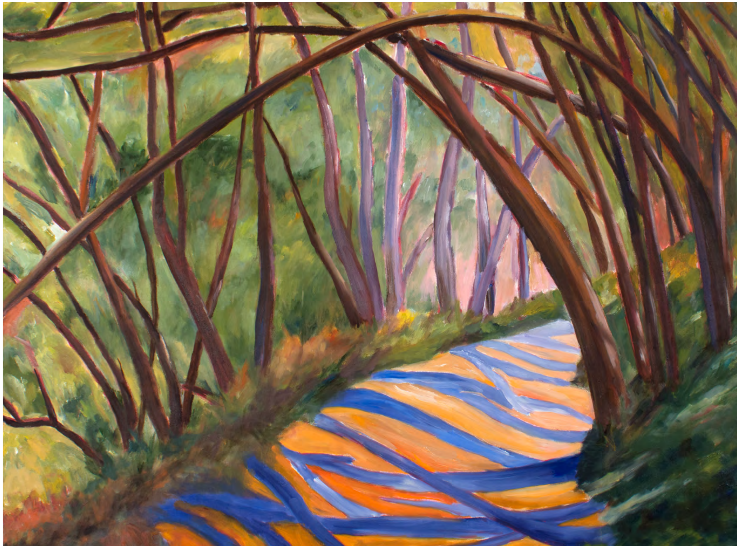
Path to Pebble Beach 2020 40 x 30 inches Oil on Canvas