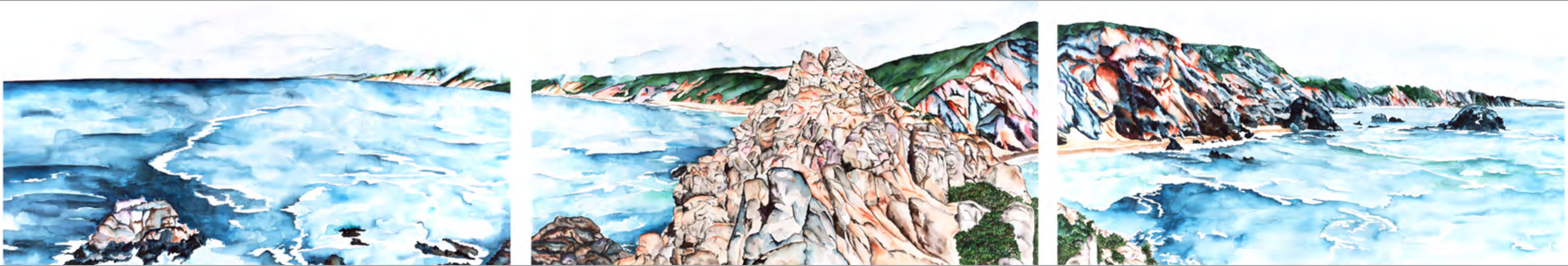
McClures Rock Looking North and South Triptych 1990 - each panel 42 x 24 inches Watercolor on Arches paper