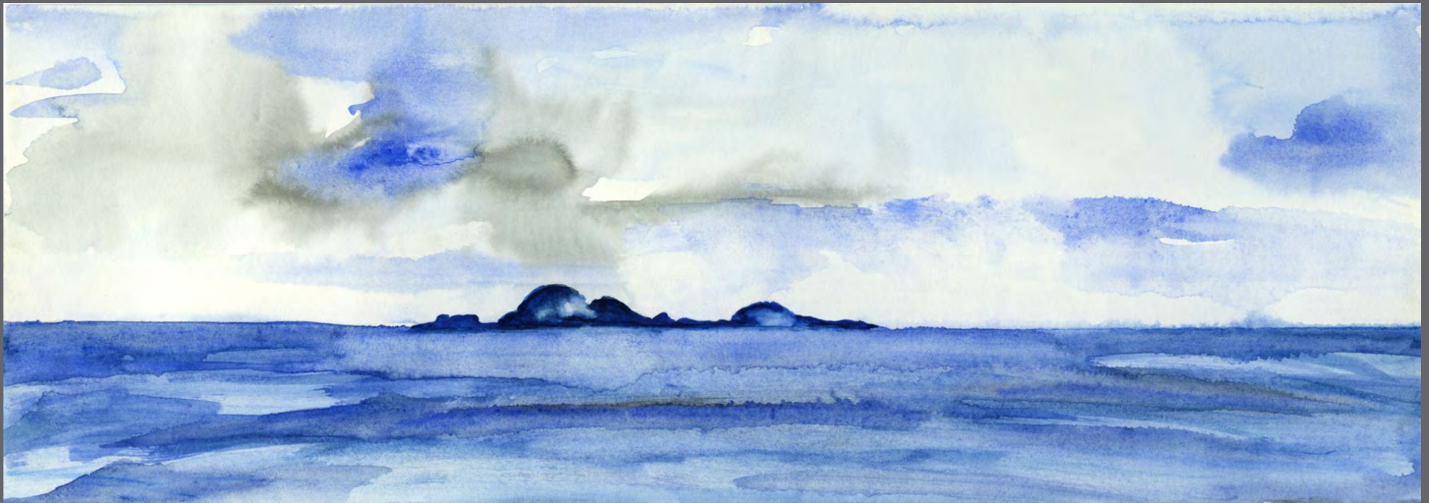
The Farallones 1991 34 x12 inches Watercolor