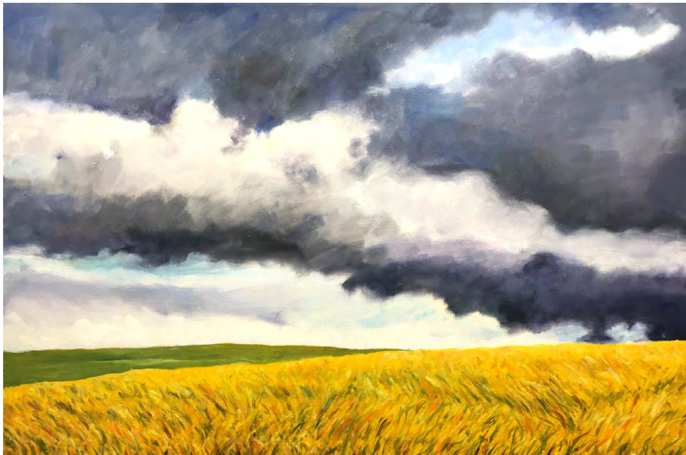
Yellow Fields and Storm Clouds 2018 36 x 24 inches Oil on Canvas