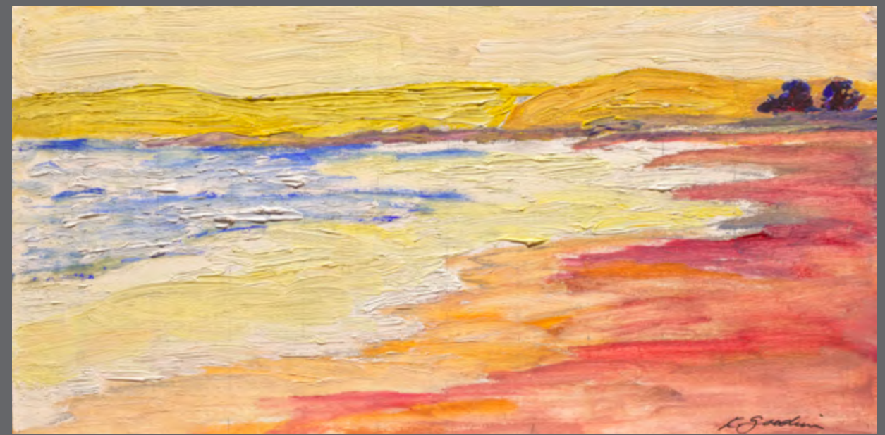
Limantour Beach 12 x 6 inches Oil on Museum Board