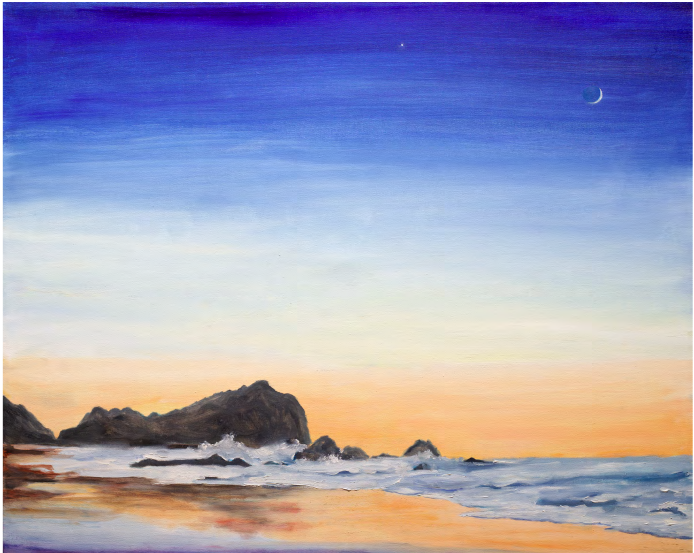
Crescent Moon, McClures Beach 2 2023 30 x 24 inches Oil on Canvas