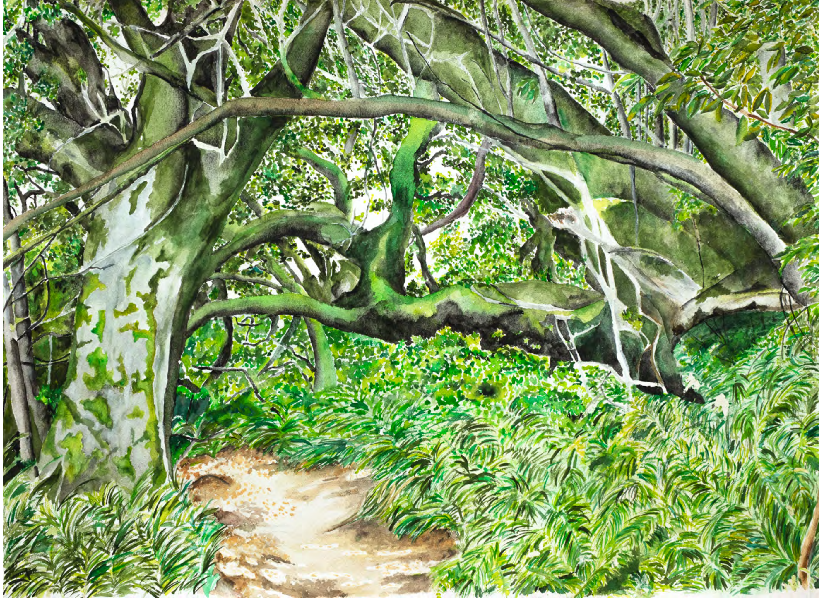
Path to Pebble Beach 2020 28 x 20 inches Watercolor