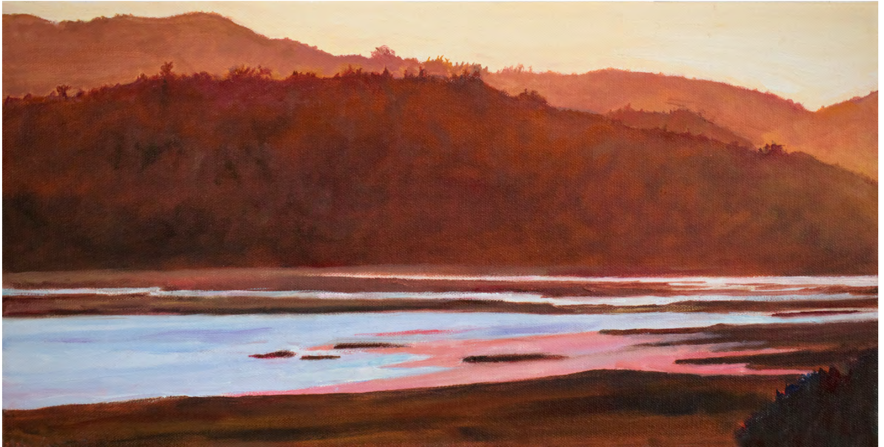
Giacomini Wetlands and Inverness Ridge 2018 20 x 10 inches Oil on Canvas