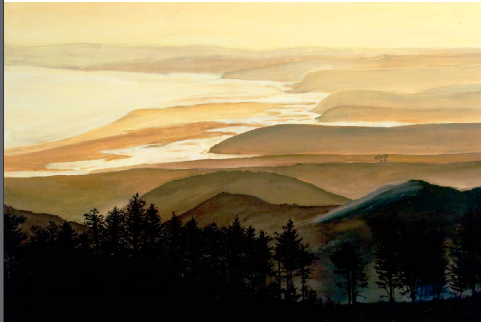
View of Limantour Spit and Drakes Bay 2016 32 x24 inches Oil on Canvas