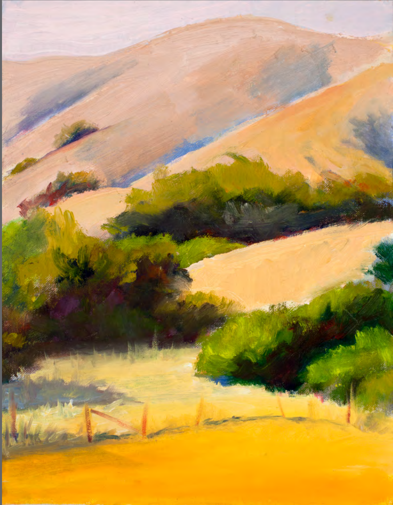
Hills from Spirit Rock, San Geronomo Valley c. 2018 11 14 inches Oil on canvas board