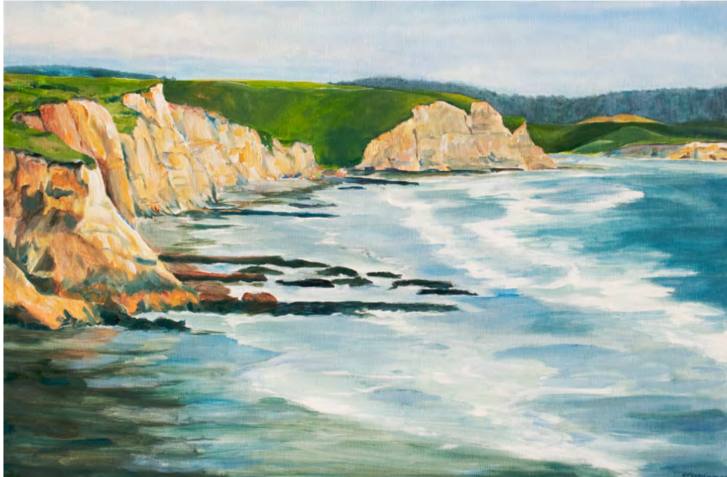
Drakes Beach Looking South 2007 36 x 24 inches Oil on canvas