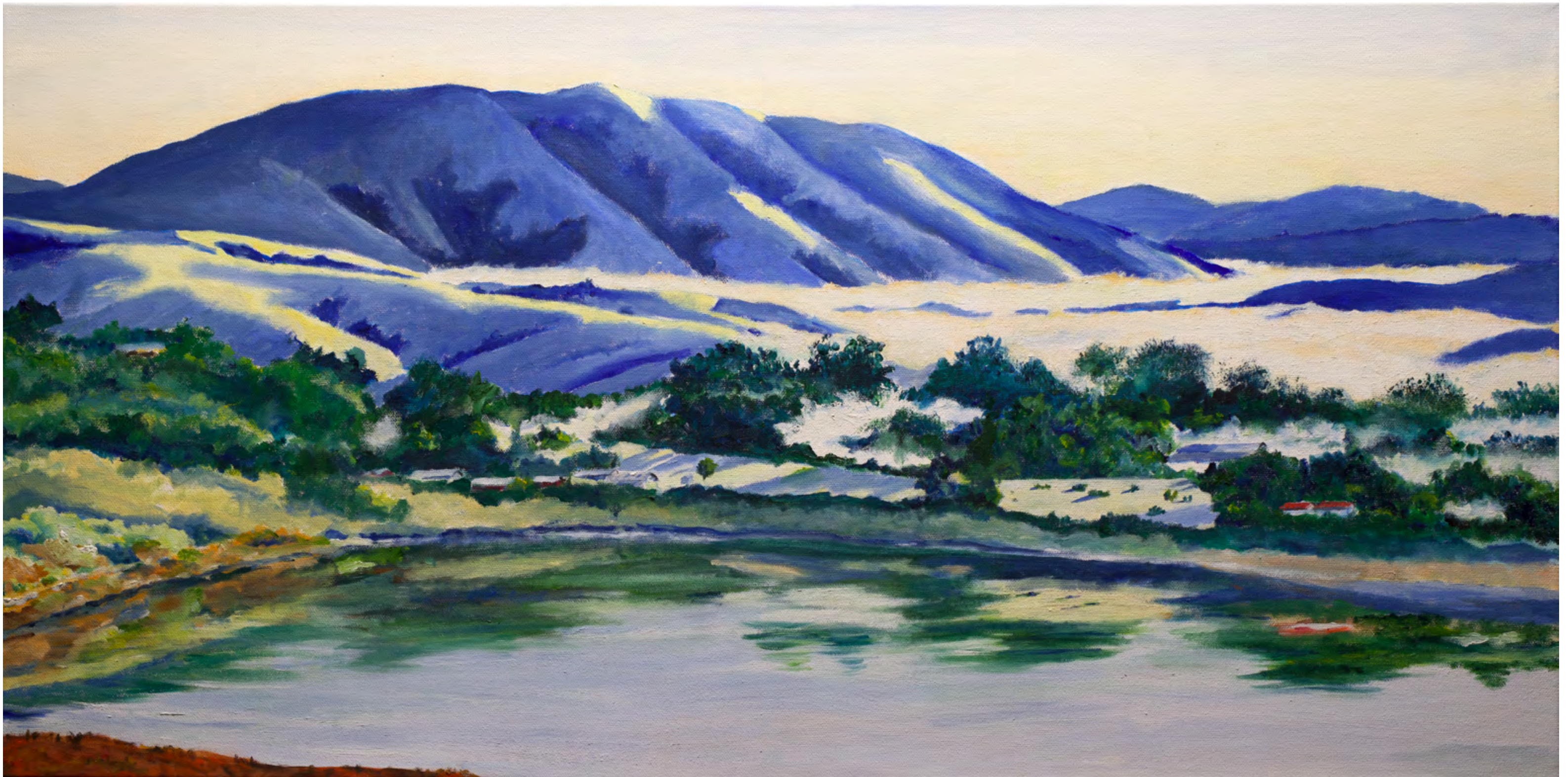
Elephant Mountain, Blue, and Early Morning Fog 2023 36 x 18 inches Oil on Canvas