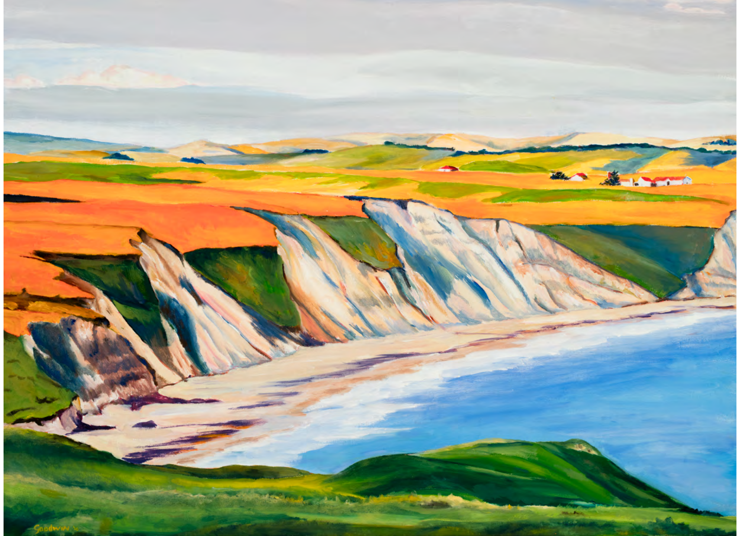
Drakes Beach and Orange Fields 2016 40 x 30 inches Oil on Canvas