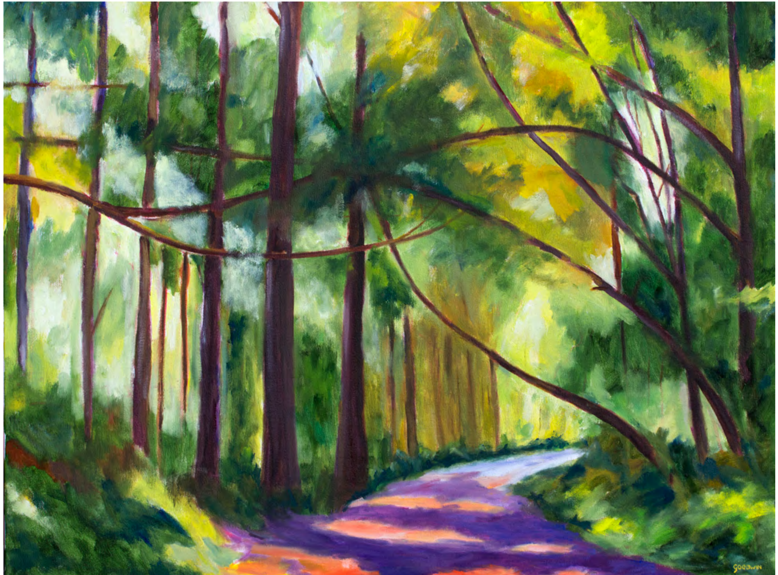
Path through the Redwoods, Samuel Taylor State Park 40 x 30 inches Oil on Canvas