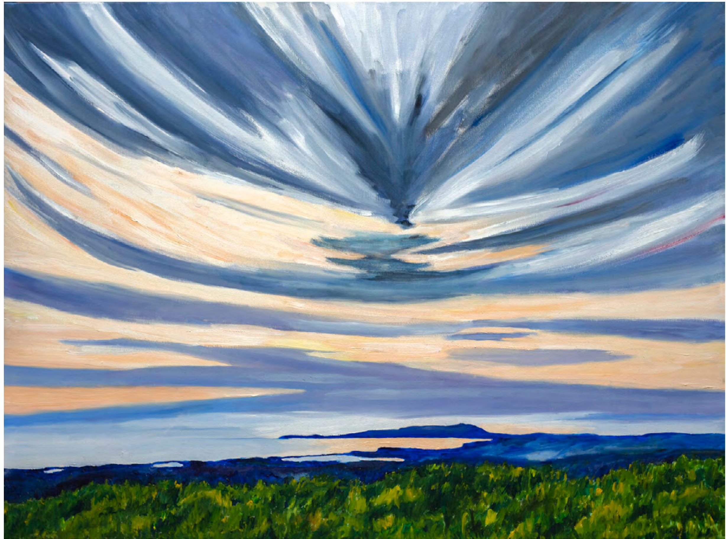
Storm Clouds over Point Reyes Headlands 2020 48 x 36 inches Oil on Canvas