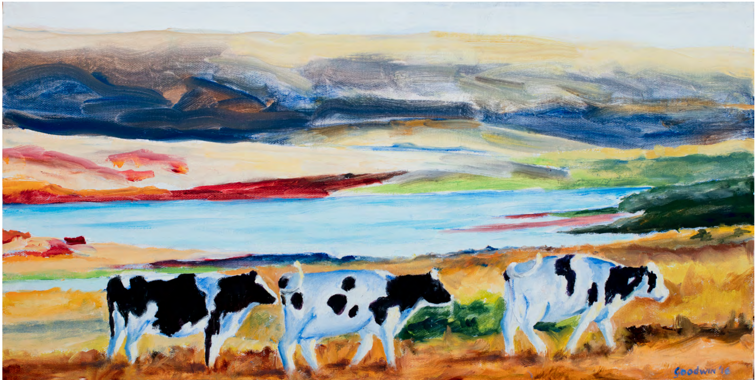
Three cows walking and Drakes Estero 2016 20 x 10 inches Oil on Canvas