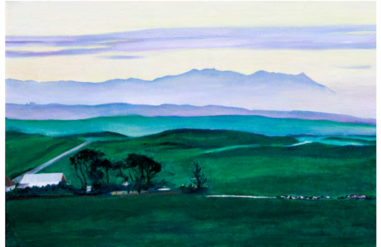
Spaletta Ranch and Point Reyes Headlands at Sunset 2007 36 x 24 inches Oil on Canvas