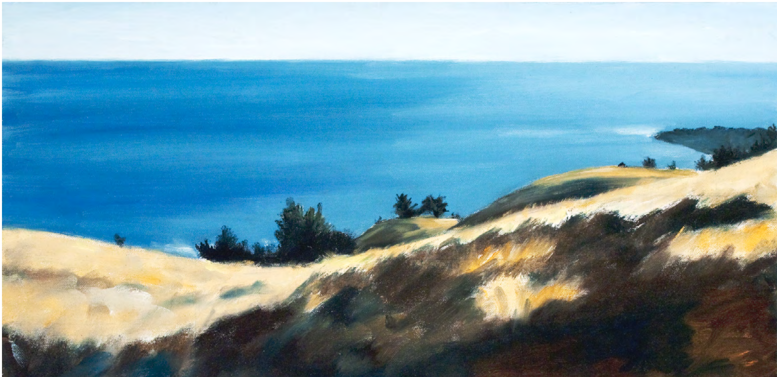
Slopes of Mt. Tamalpais with Bolinas, Summer 2008 24 x12 inches Oil on Canvas