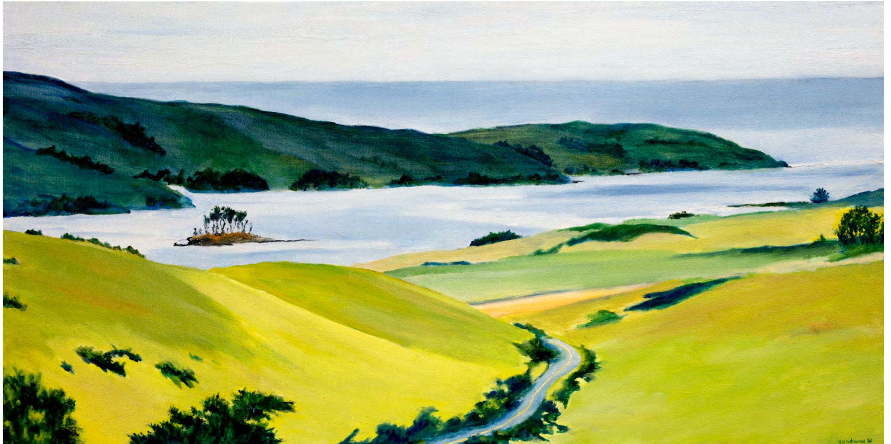
Hog Island and Tomales Bay 2021 48 x 24 inches Oil on Canvas