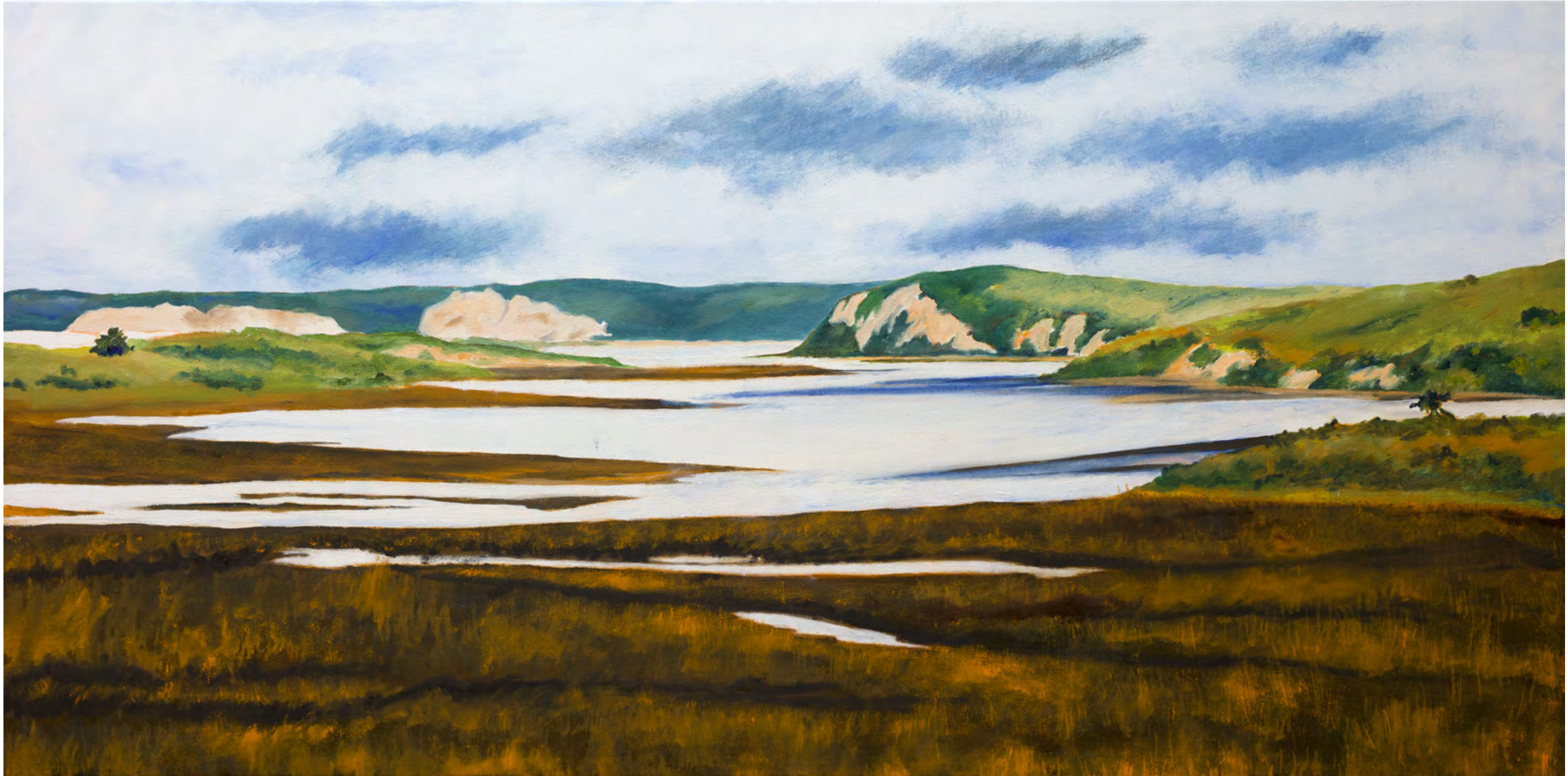
Estero de Limantour 2021 48 x 24 inches Oil on Canvas