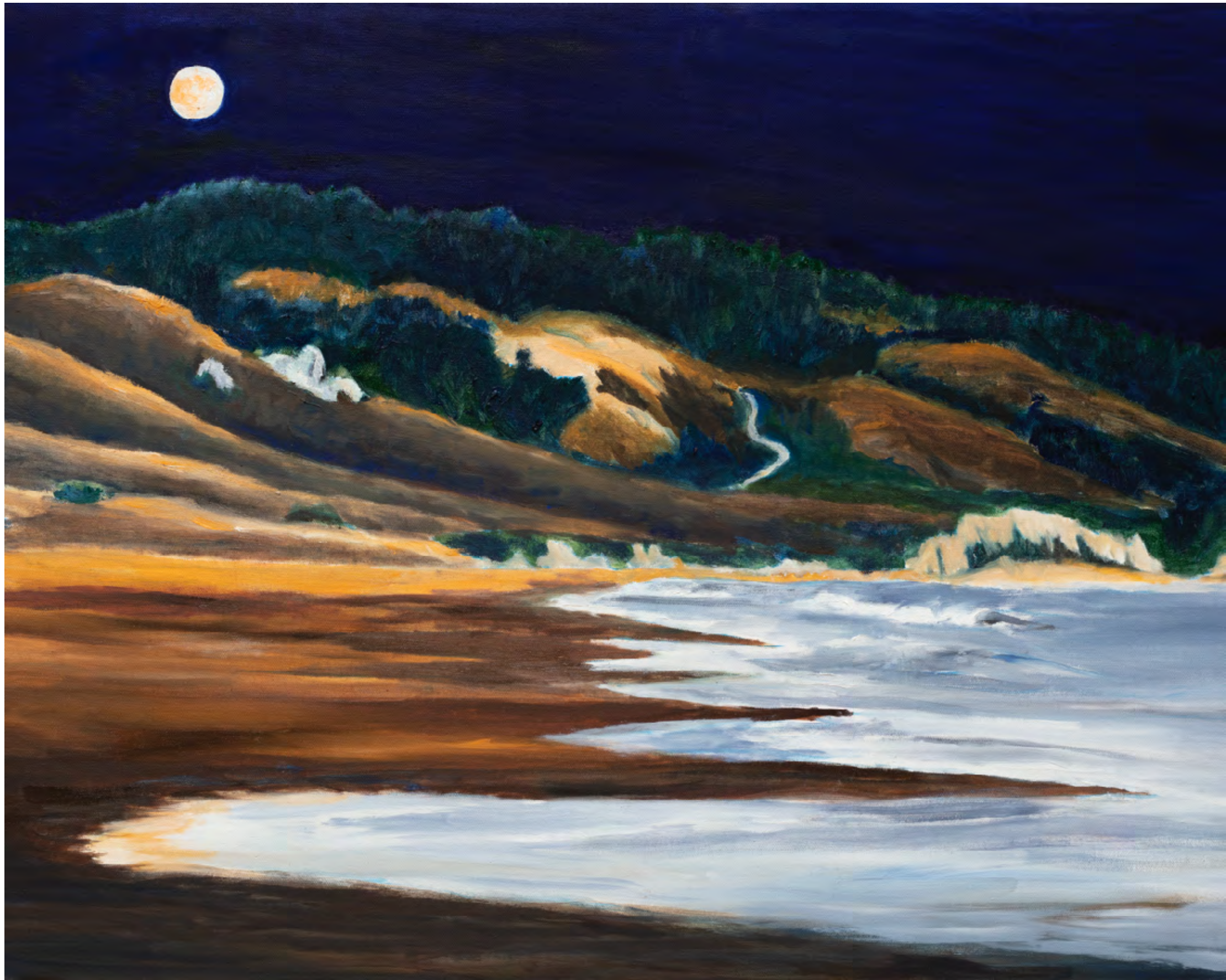
Full Moon at Limantour Beach 2018 36 x 24 inches Oil on Canvas