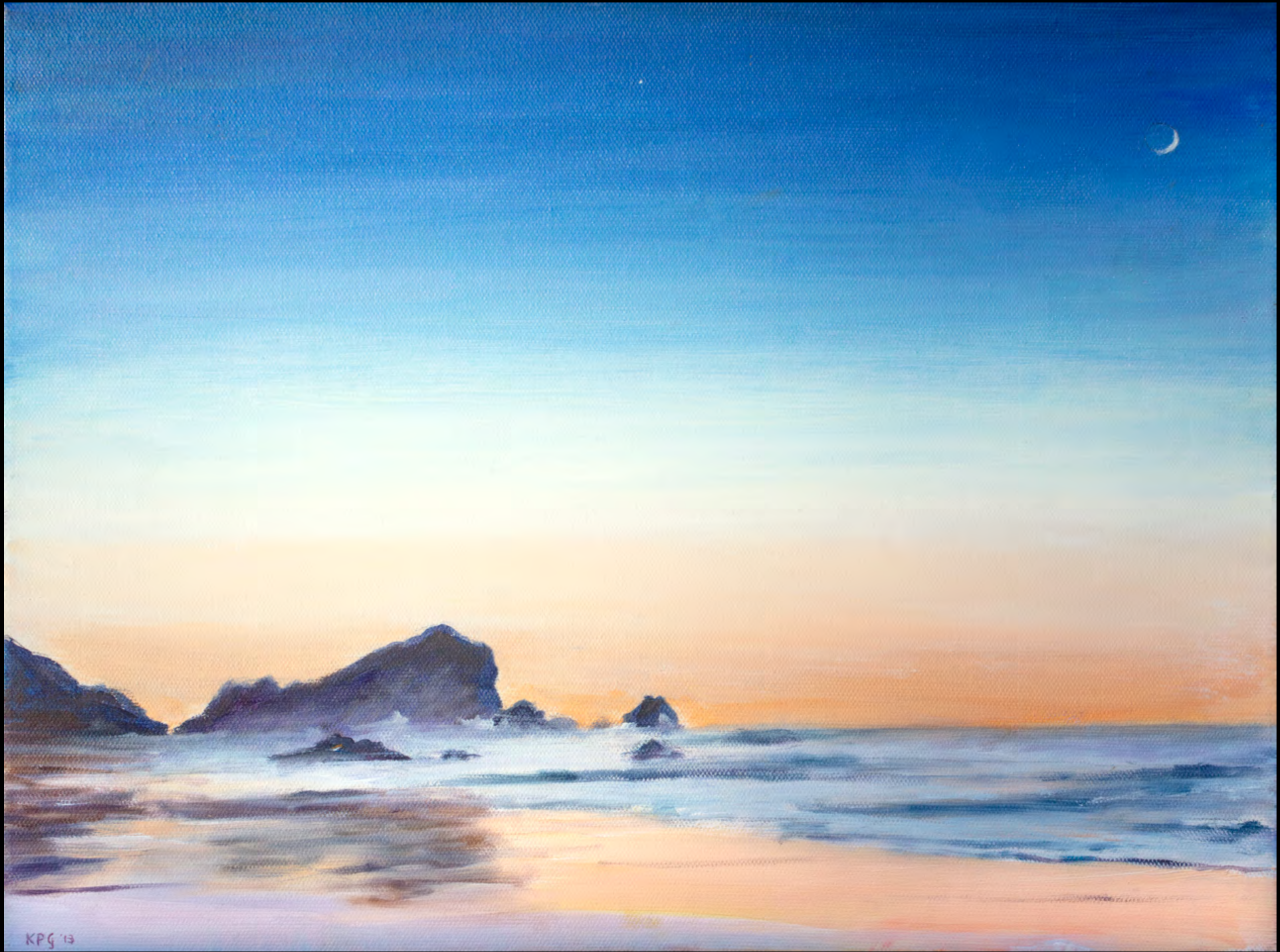
Crescent Moon at McClures Beach 2013 16 x 12 inches Oil on Canvas