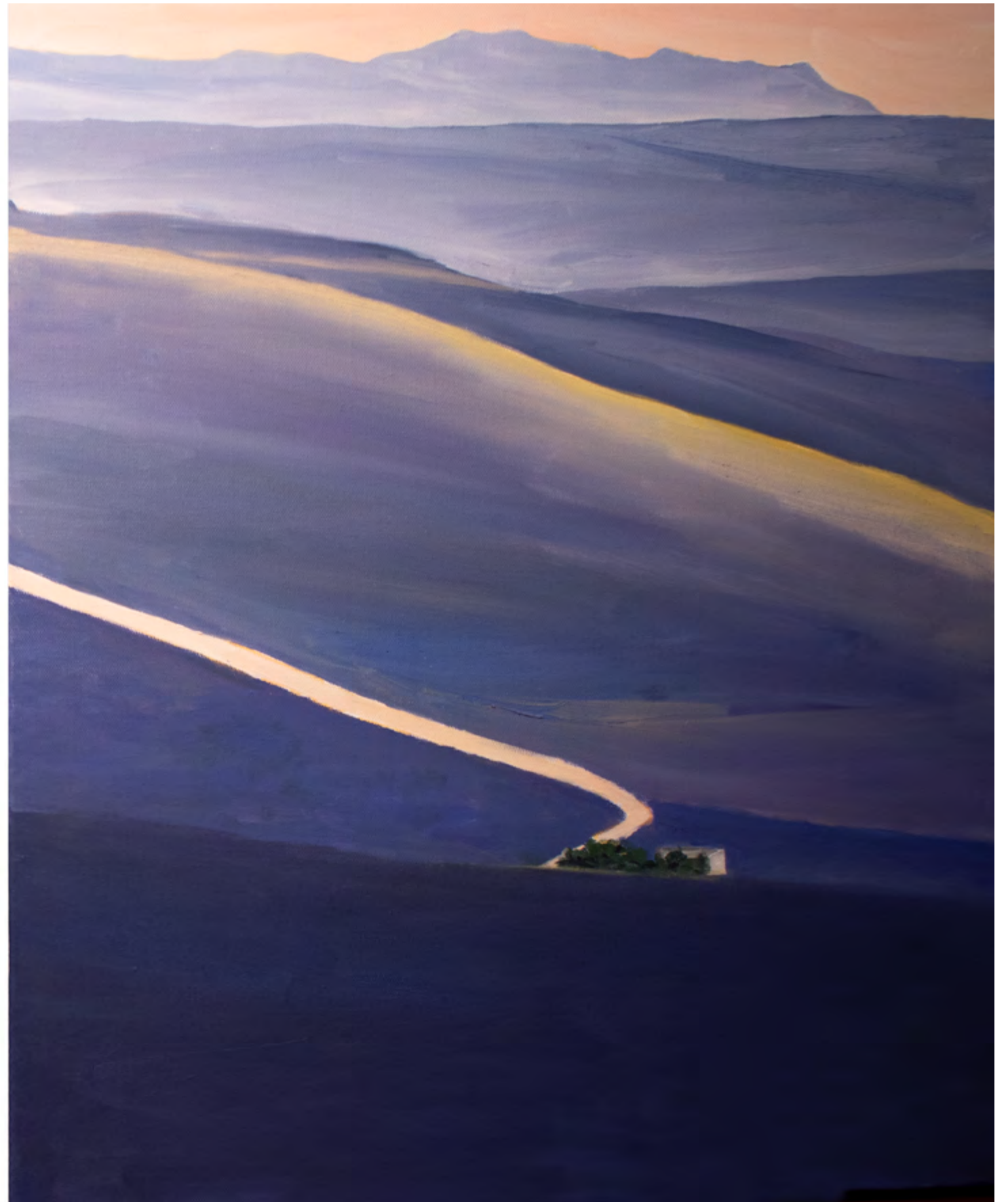
Grossi Farm and Point Reyes Headlands 2016 Each panel 20 x 24 inches Oil on Canvas