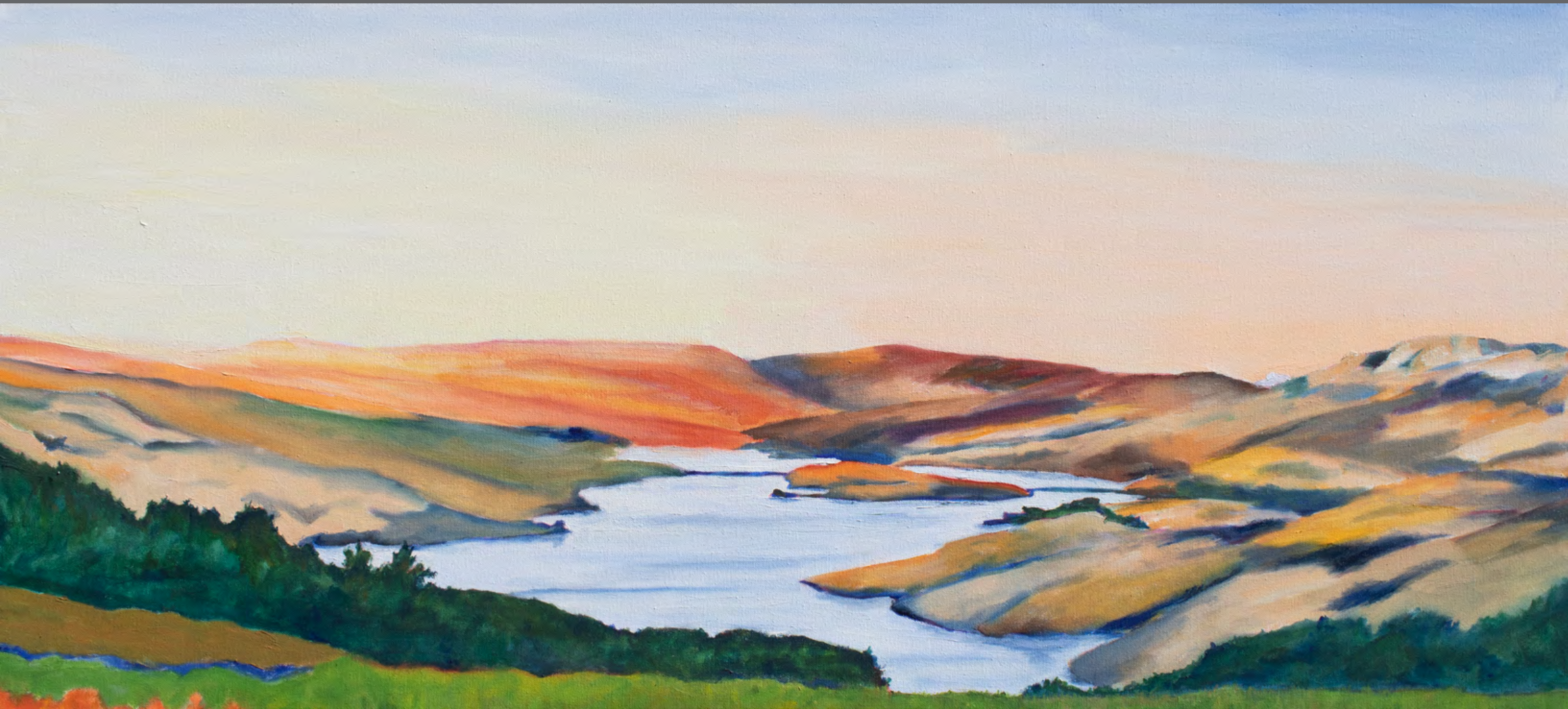
Nicasio Reservoir Looking North 2018 30 x 10 inches Oil on Canvas