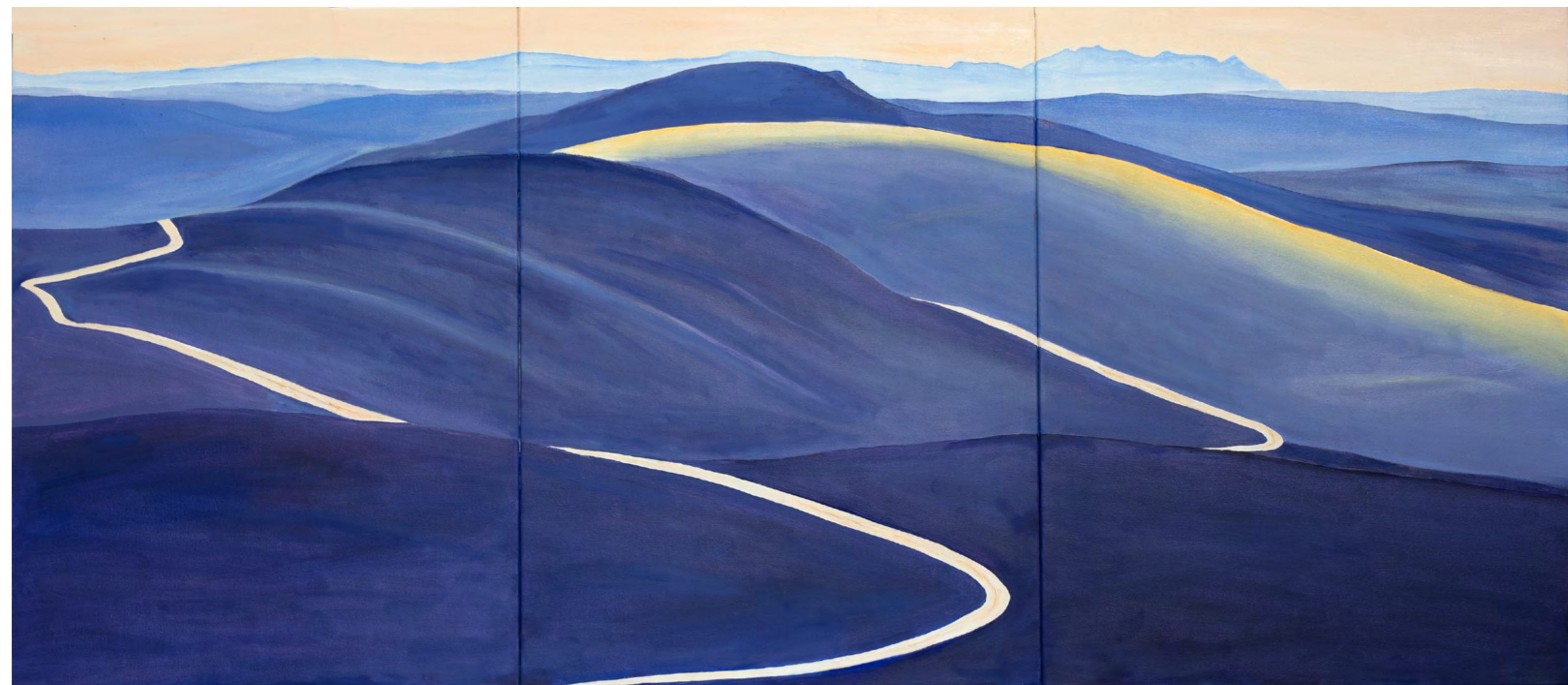
Purple Hills Triptych 2019 each panel 30 x 40 inches Oil on Canvas