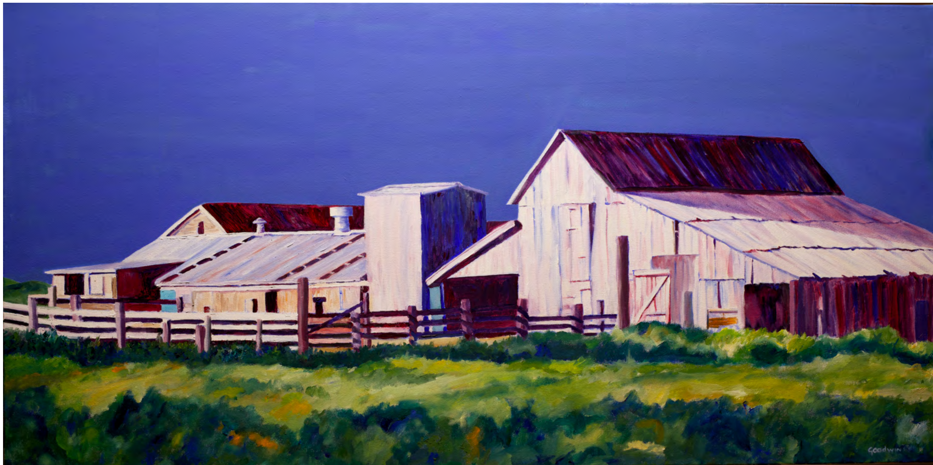
Ranch near Drakes Beach 2018 48 x 24 inches Oil on Canvas