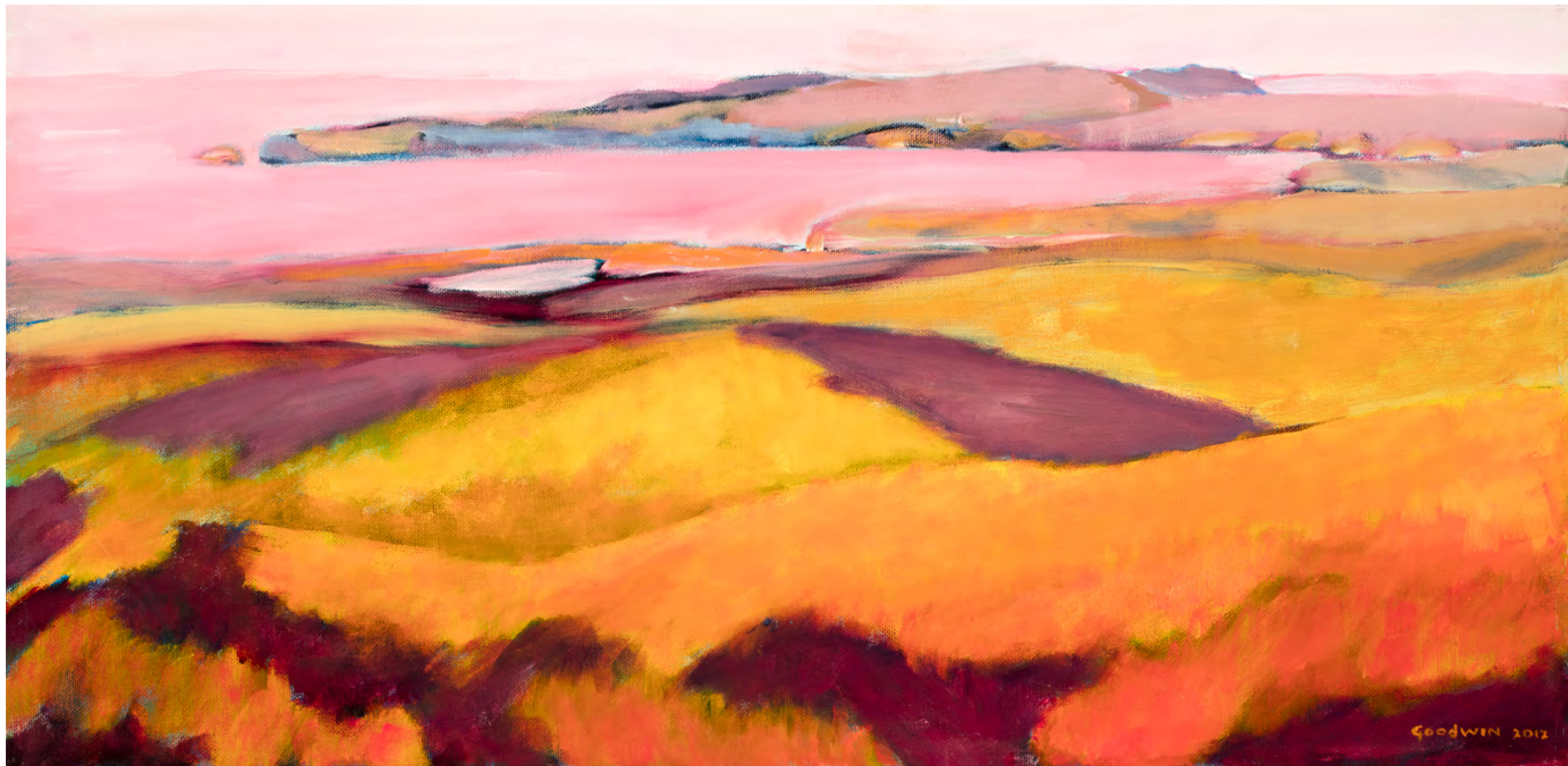
Drakes Beach from the Hills above Limantour Beach 2012 24 x 12 inches Oil on Canvas