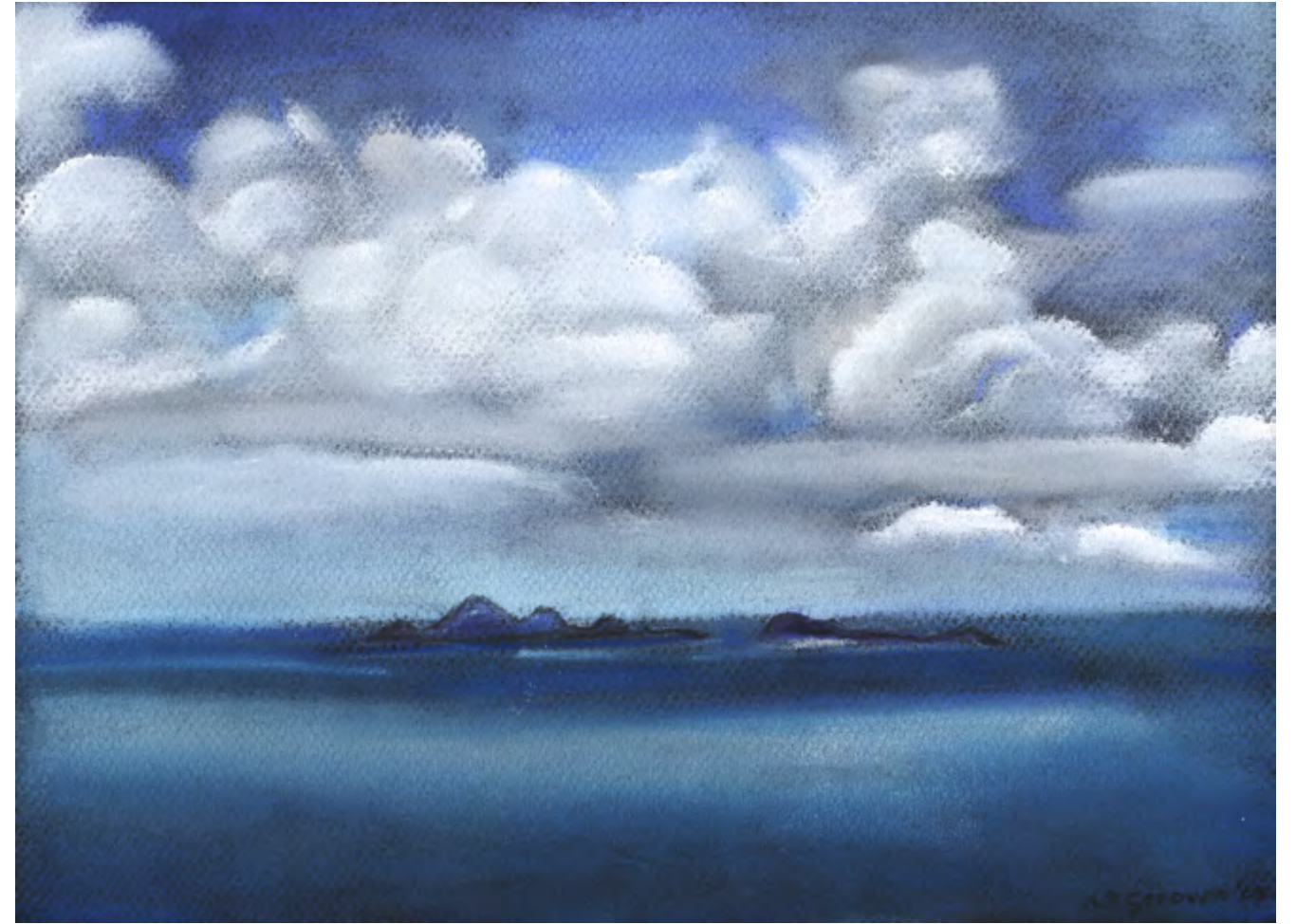
The Farallones and Storm Clouds 2003 14 x 11 inches Pastel on archival paper