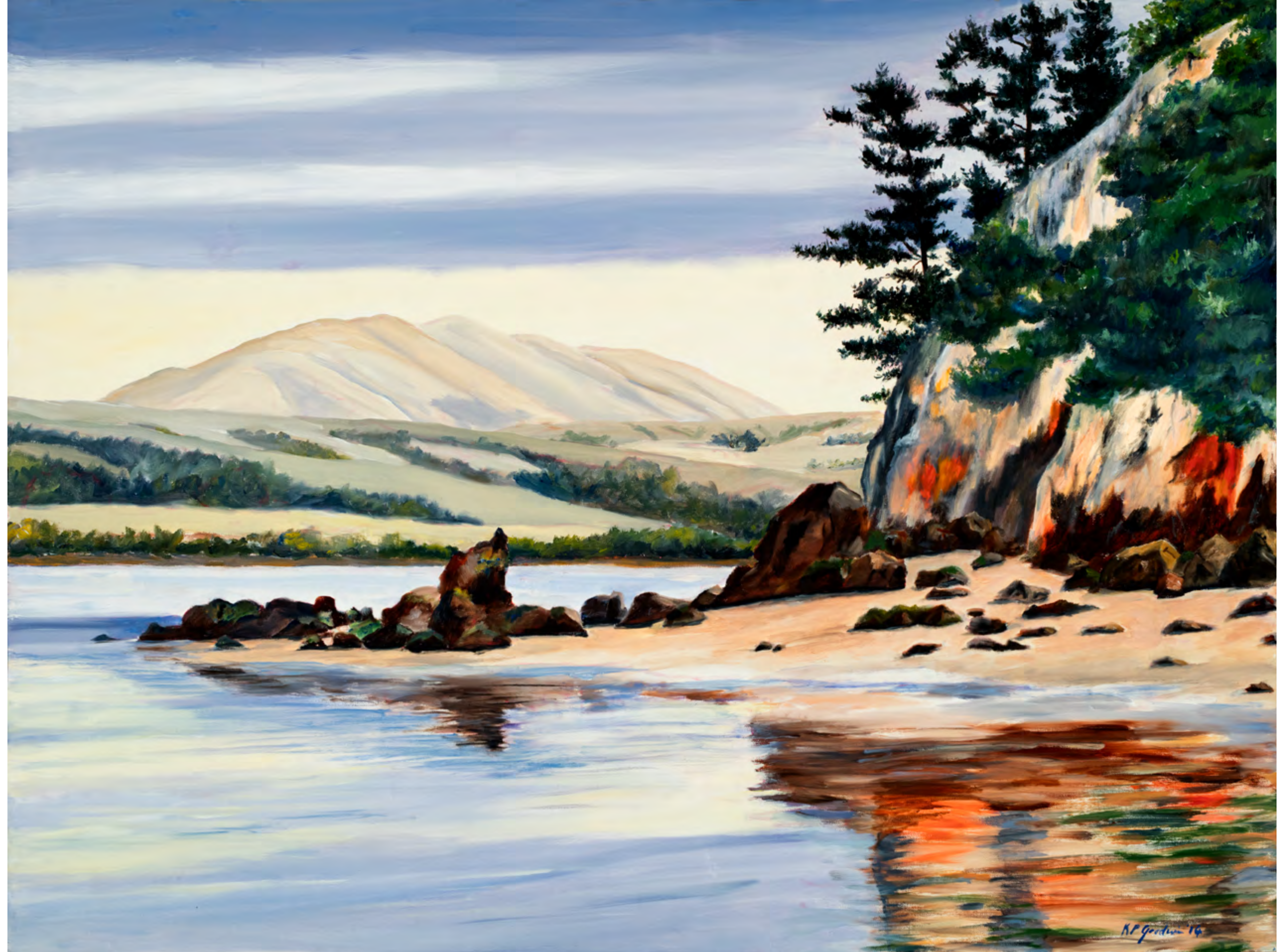
Elephant Mountain and Shell Beach 2014 40 x 30 inches Oil on Canvas