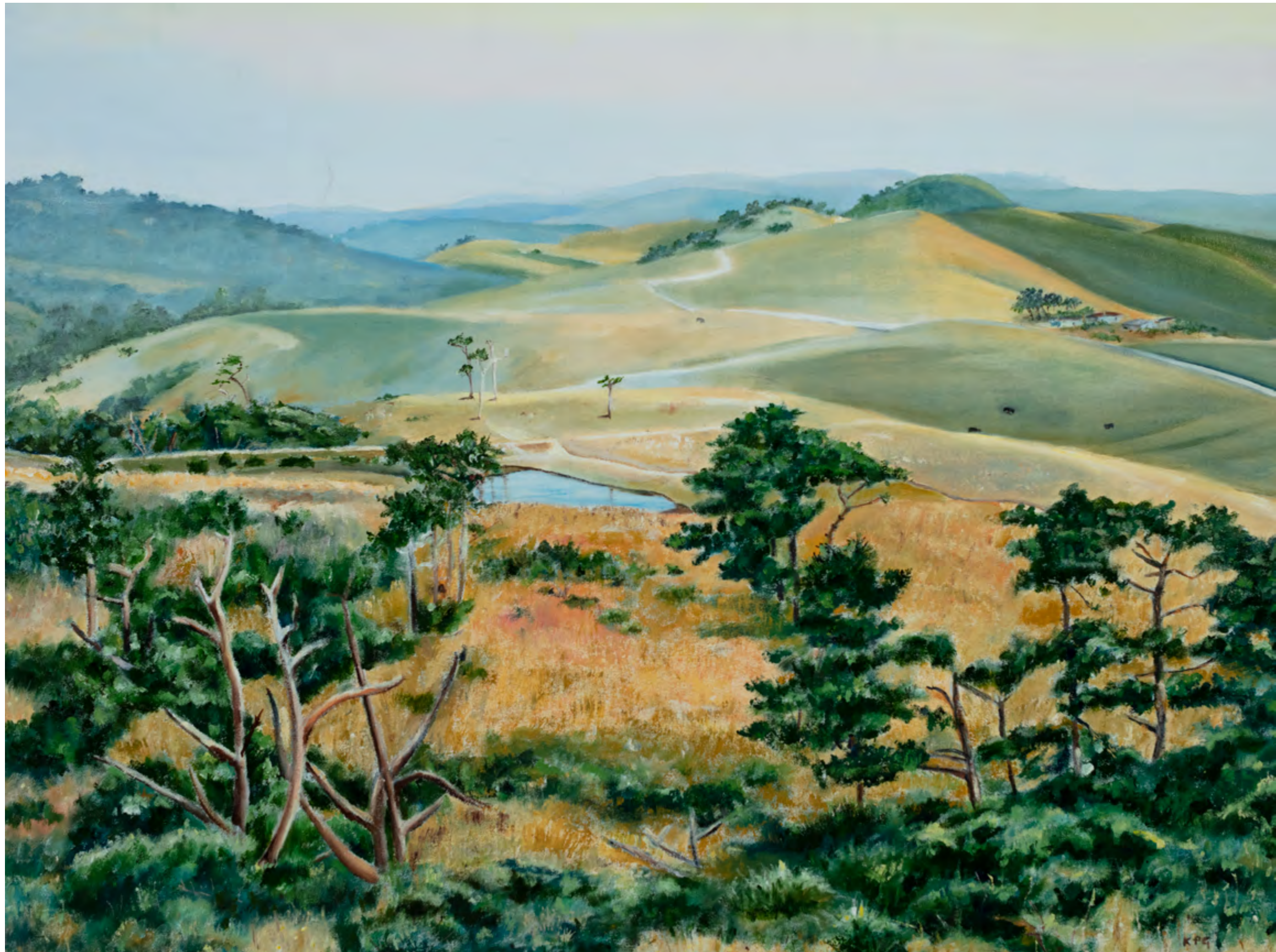
Grossi Pond and Bishop Pine 2017 40 x 30 inches Oil on Canvas