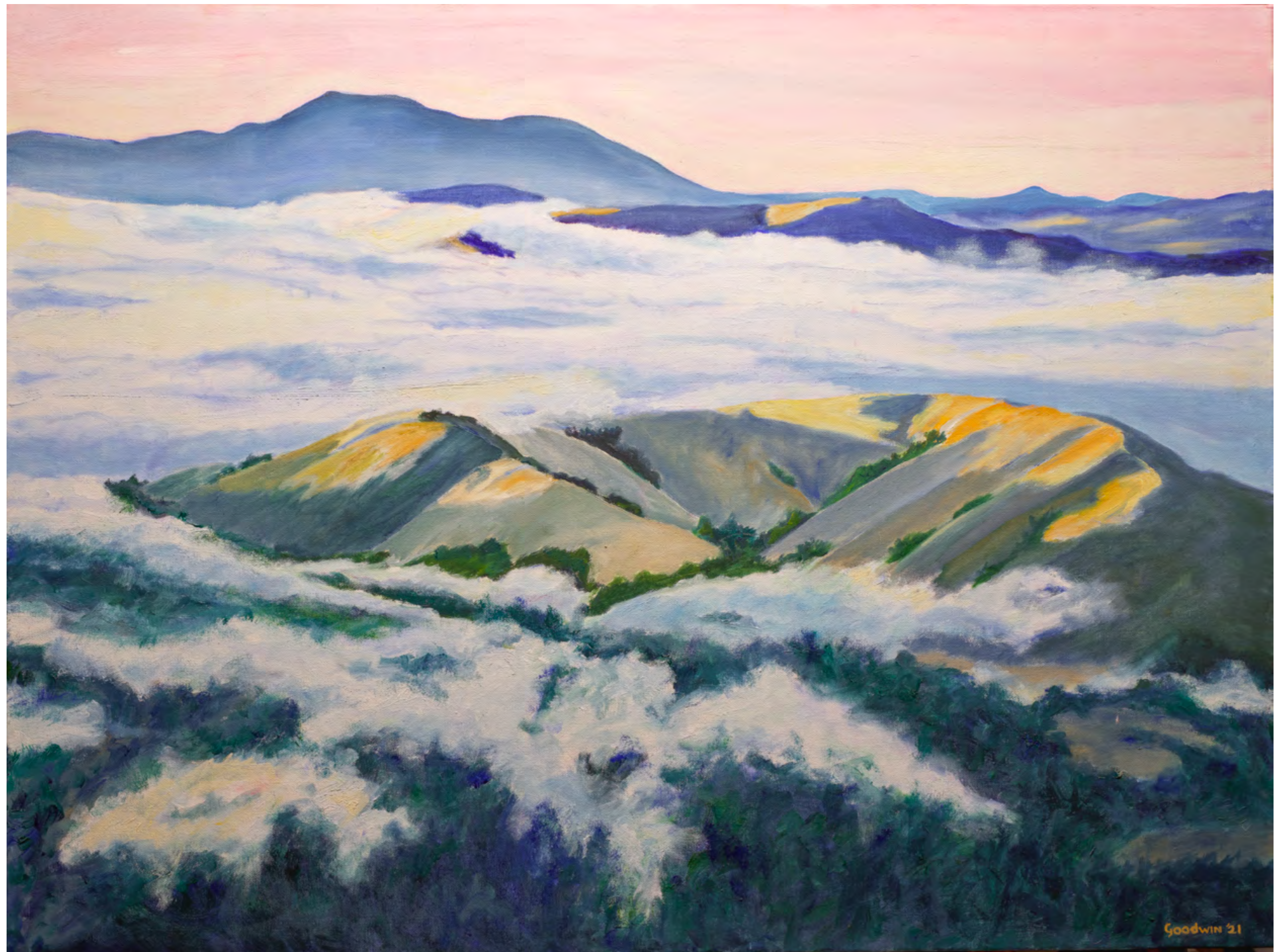
Pilot Knob and Mt. St. Helena from Mt. Tamalpais with Fog 2014 40 x 30 inches Oil on Canvas